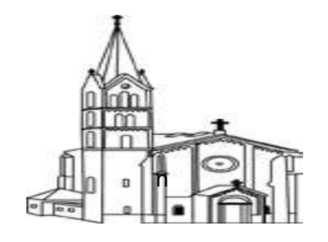
St. Mary's 504 N Sycamore Street Pleasanton. NE 68866

515 Sicily Avenue (Church & Rectory) 324 E. Corinth Avenue (Parish Center & Office) PO Box 90 (Mailing Address) Ravenna, NE 68869